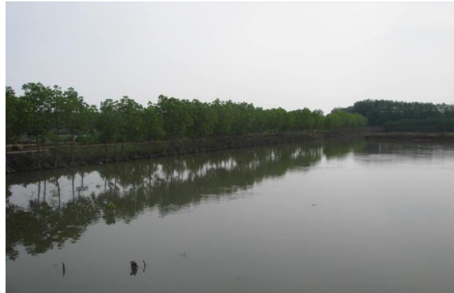
Fig 1. Fingerling Traditional Pond of Milkfish (Research documentation, 2017)

and CO 2 (mg L -1 , Titration technique). Furthermore, Nitrate (mg L -1 ), Orthophosphate (mg L -1 ), Total Organic Matter (TOM, mg L -1 ), Ammonia (mg L -1 ), microalgae periphyton identification, composition, and abundance (Ind cm 2 ) were measured ex situ .