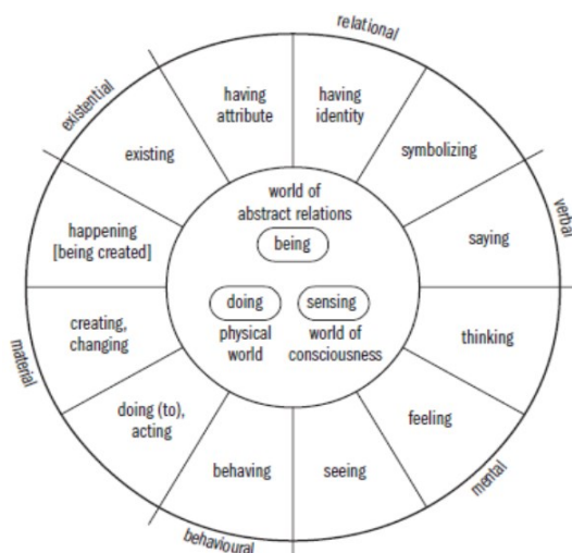
Fig 3. Types of Halliday's processes.

Processes are processes of physiological and psychological behavior, like smiling, coughing, laughing, breathing, dreaming and staring (Halliday, 2004, p.248). They are intermediate between material and mental processes. The participant labelled Behaver , is typically a conscious being like Senser , but the process functions more like one of 'doing'. Verbal Processes are processes of 'saying' of any kind. The verbalization itself is termed 'verbiage' and the participants associated with it are 'Sayer' - the one who gives out the message, and 'Receiver' - the one to whom the message is sent (Halliday, 2004, p. 252-255). Existential Processes show that something exists or happens (Halliday, 2004, p. 256). The word used in such clauses has no identified function or meaning. The typical verbs used in these clauses are 'be', 'exist', 'arise'. The nominal group that follows these verbs is called 'Existent'.