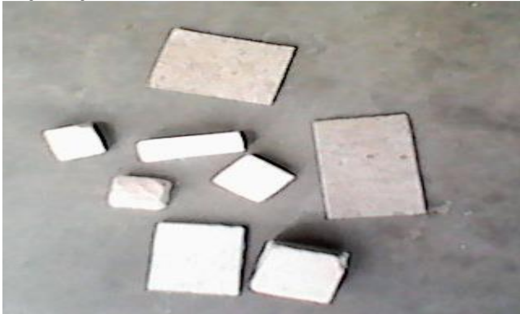
Figure 1: Test samples of the dry porous materials

All the porous materials gathered for this research work were subjected to continuous sun-drying and weighing until no change in mass was observed in each case. This was necessary in order to ensure that the test samples contained no moisture. The materials were then cut into three test samples, each, of regular shape. Also, one sample, being the fourth in each case was shaped for the standard test in order to determine the reference bulk density value. Some of the samples are shown in figure 1 below.