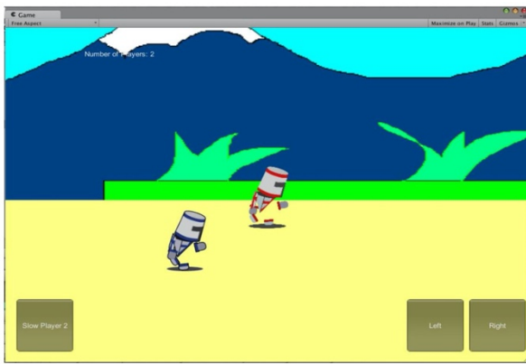
Fig. 2 Racing Game Screenshot