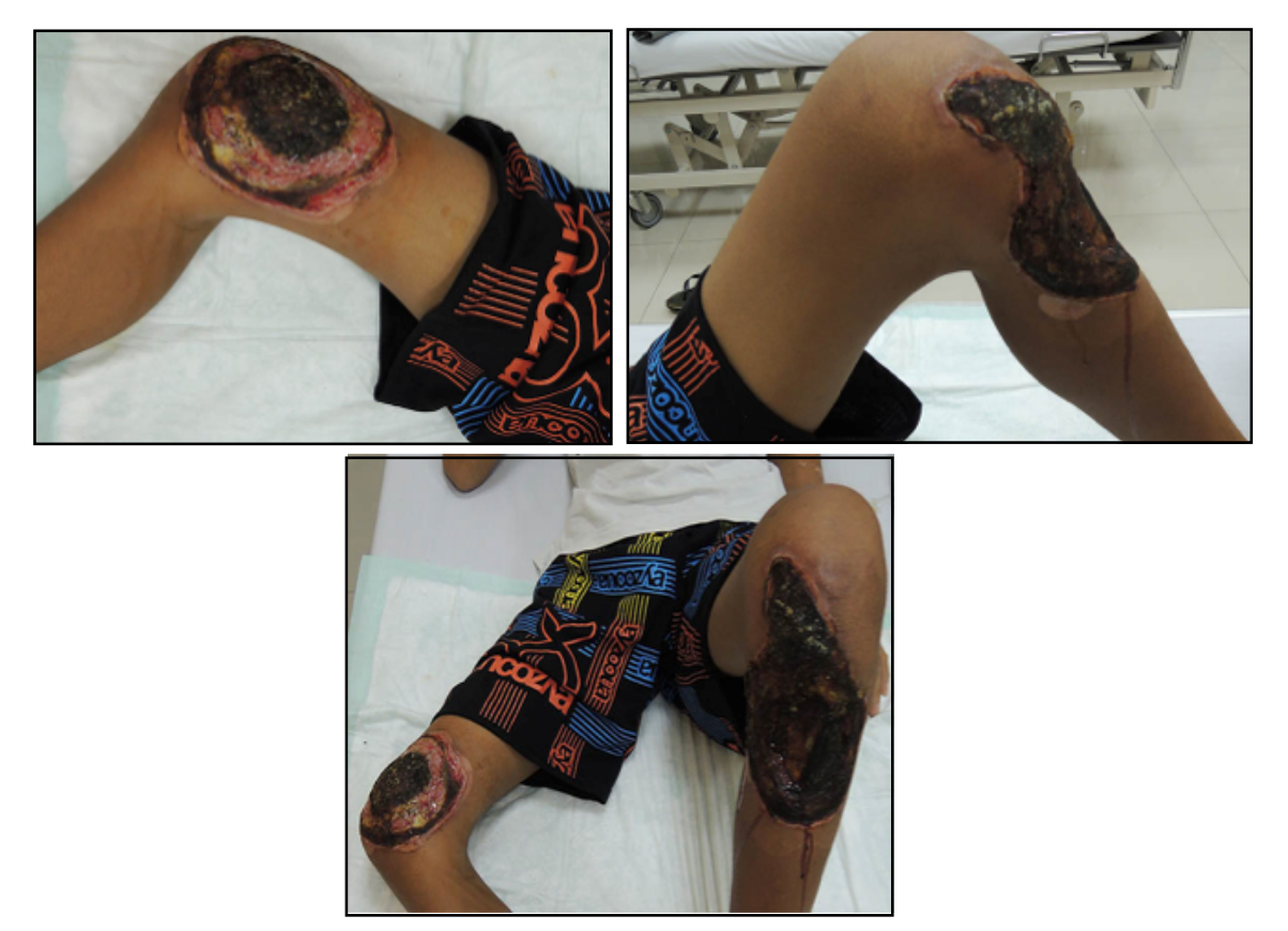
Figure 1. Above Left : Patient at admittance. contracture of the right knee. Above Right : contracture of the left knee. Below : wound on both knee joint

Volume 2 - Number 3 - Managing Neglected Burn Wound with Exposed Upper Tibia