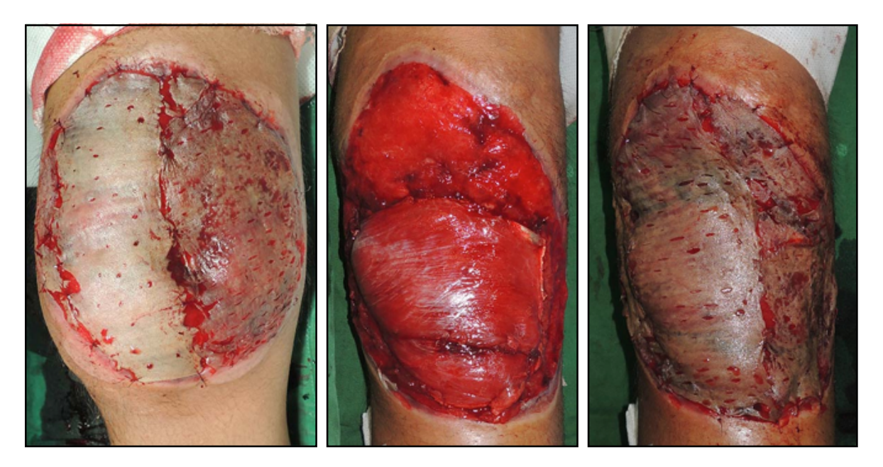
Figure 3. Left : STSG covering right leg wound. Middle : Gastrocnemius muscle flap covering left leg wound. Right : STSG on left leg covering the gastrocnemius muscle flap.