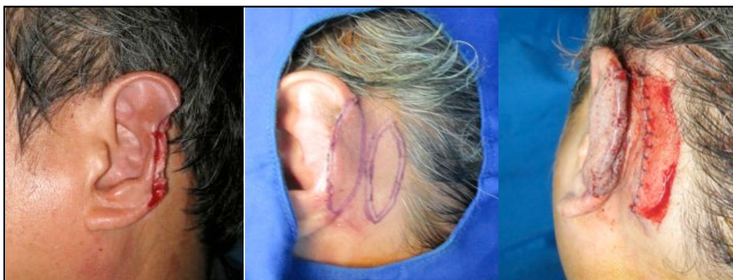
Figure 3. Case number 3. Left: Amputated left auricle with the amputee. Middle: Graft buried in the skin flap pocket. Marker in retroauricular region is donor STSG area to cover posterior auricula defect. Right: Posterior cartilage site covered with STSG.