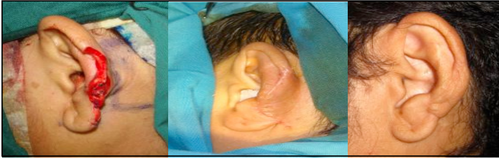
Figure 1. Patient in case 1. Left: After debridement and resuturing of salvaged cartilage. Marker on the retroauricular region is area for pocketing. Middle: Cartilage graft buried in the skin flap. Right: Twenty months after surgery.