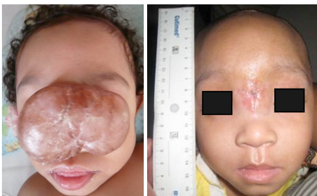
Figure 3. A 22-month old girl with frontoethmoid type FEEM. (Left) Preoperative frontal view demonstrating a large mass in the central of the face with low quality of overlying skin. (Right) Postoperative frontal view after single-stage reconstruction.