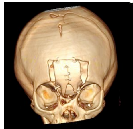
Figure 4. Post-operative CT-scan image of the patient. The medial third portion of the T-shaped osteotomy was used to cover bone defect in the superomedial parts of the orbits. In this image, that bone is seen underneath the lateral fragments joined