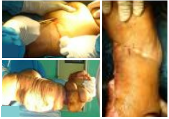
Figure 4. Suction fibrotic tissue (upper left), Size reduced after suction (bottom left), Release constriction band with Z plasty incision (right)