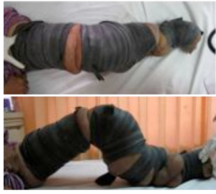
Figure 3. Application of compression bandage bicycle inner tire, wrapped from distal to proximal, front view (left),