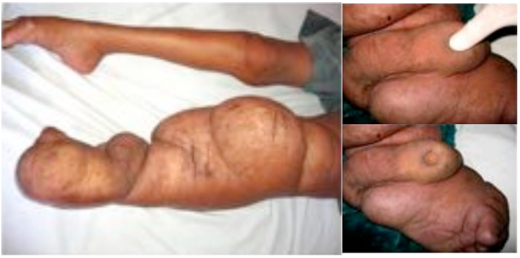
Figure 2. (Left) Lymphedema limb and constriction band, noted the right leg with different entity, poliomyelitis. (Middle) Pitting in several site during pressed, (Right) and