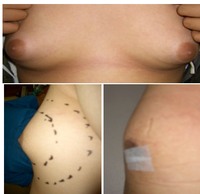
Figure 3. A. A 12-year-old with moderate enlargement gynecomastia with ptosis. B. Lateral view preoperative. C. Postoperative result showing a normal chest wall contour.

A 30-year-old male came to outpatient clinic with enlargement of bilateral breast. No history of previous drugs consumption. From physical examination, there is a moderate enlargement of the breast. No palpable glandular mass on both breasts. Before bringing