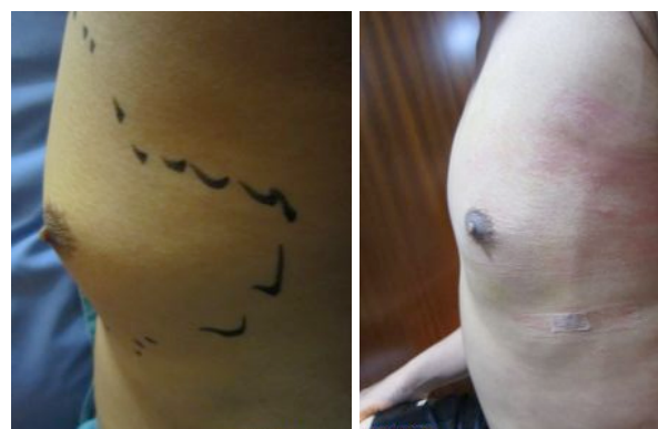
Figure 4 A. Lateral preoperative view of a 40-year-old male with bilateral gynecomastia. B. Postoperative views show restoration of a normal chest contour.

Gynecomastia was a common problem of the male breast. It generally presents as an aesthetic complaint. The associated emotional trauma can have real consequences for adolescent boys afflicted with this condition. A