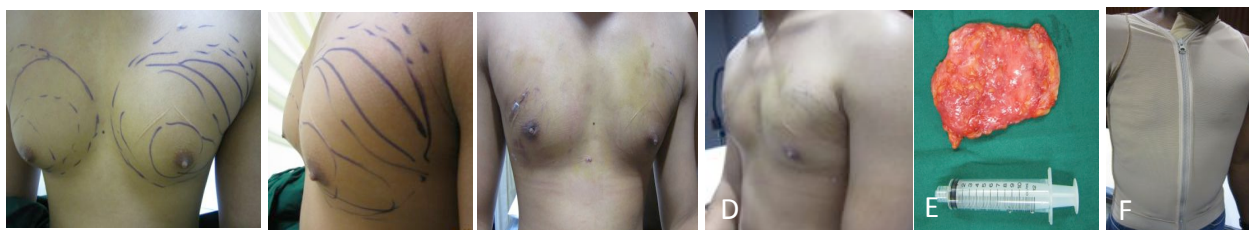
Figure 1. A dan B: A 33-year-old male with bilateral gynecomastia, previously underwent multiple incisions as therapy of alternative medicine. C and D: day 10 after surgery. E: Appearance of fibrous tissue after excision. F: Compressive vest used until 4 to 6 weeks after surgery.

right upper quadrant of the left breast. Other physical examinations and laboratory result are normal. The area of breast enlargement and locations of glandular masses are marked in the upright position. The patient then sedated and underwent liposuction procedure. A semicircular incision at the inferior areola-cutaneous junction is performed to remove residual fibrous tissue. In postoperative visit day 9 after surgery, the patient still using elastic bandage on the breast. There is no hematoma shown. The patient feels satisfy with the postoperative result. See the patients pictures from Figure 2.