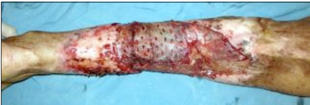
Figure 2. Tumor excision and defect coverage by split-thickness skin graft.

Patient was treated in the ward for two weeks after surgery with antibiotic and analgetic administration. Seven days postsurgery, the STSG took 100%. Patient was scheduled for a weekly follow-up visits in RSCM's Plastic Surgery Clinic. Four months after the wide-excision surgery, two small