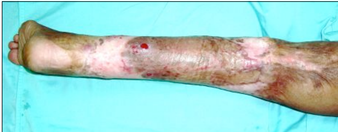
Figure 4. Two weeks post spontaneous lesion occurrence and re-biopsy, wound is healing.

wounds appeared on the area that was been covered by kin graft (Figure 3). Another biopsy was performed, and the pathologist revealed findings of epidermal cyst and granulating tissue, with sign of malignancy. The wound were treated with gentamycin ointment and oral antibiotic twice a day. Patient's wound eventually healed within a few weeks and patient was able to return to his daily activities with minimal discomfort. To prevent SCC recurrence, the patient was advised to undergo adjuvant radiotherapy, but until this article is published the patient had not complied.