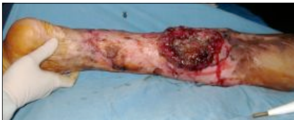
Figure 1. Tumor mass on the left posterior calf, oval in shape, uneven surface with nodular lesions. Size: 15 cm x 8 cm x 5 cm, mobile, irregular border. Induration, ulceration, erosion are present. Mass easily bleeds, malodorous, and painful.

Incisional biopsy of the lesion, and histopathological examination revealed tissue pieces which displayed hyperplastic and hyperkeratotic stratified squamous epithelium, with irregular growth, papillary in some part. Epithelial tumor cells are found clustered in the dermal layer with mild pleomorphic nuclei,