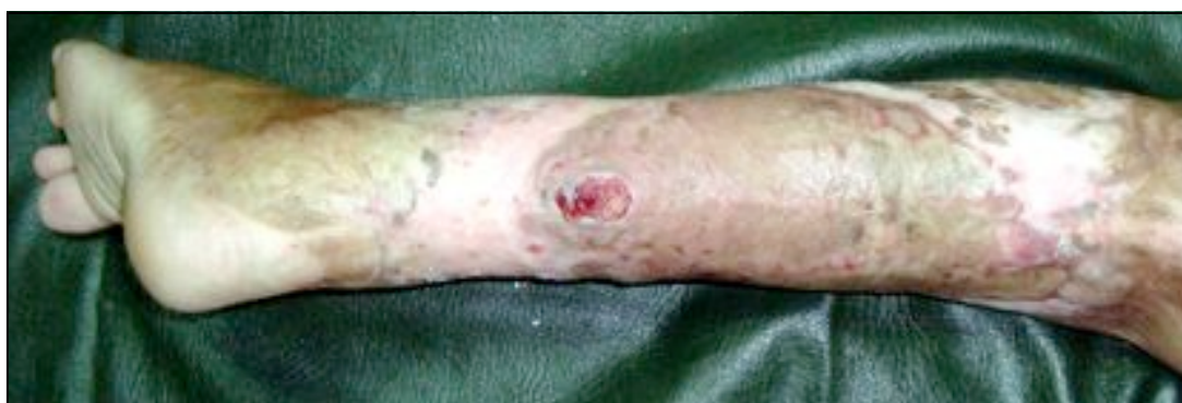
Figure 3. Four months post excision and graft, spontaneous lesion recurs. Biopsy revealed granulating tissue with no sign of malignancy.