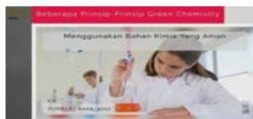
Figure 2. Green Chemistry's Illustration

The learning video shows the production of shrimp paste and presto of milkfish from Juwana, Pati. The production is used as the