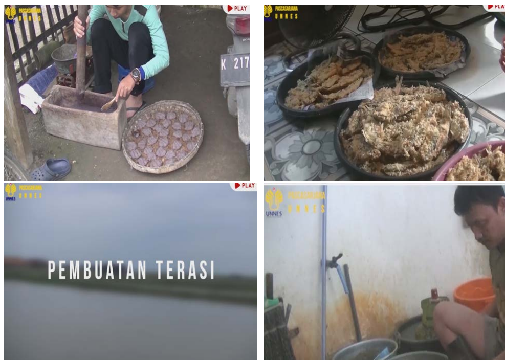
Figure 3. The Process of Shrimp Paste and Milkfish Presto

Beside the materials, the researcher asked the students to discuss, interview their parents, and interview the producer of shrimp paste and presto. Students were also asked to find out the additives in the food as the enhancer of color, taste, and maintenance from the local ingredients, can be viewed in the figure 3.