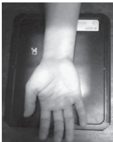
Figure 2. Radiographic technique of the wrist joint.

Figure 3, shows the comparison of compliance and non-compliance. A very few evidence of compliance was shown on the radiographic image films after being processed in the dark room.