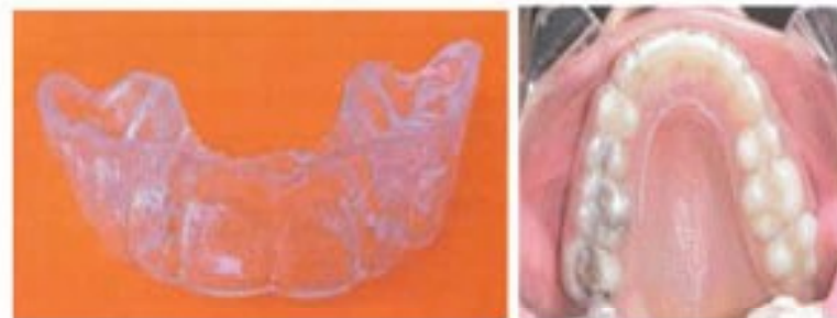
Figure 10. Essix type C. 6