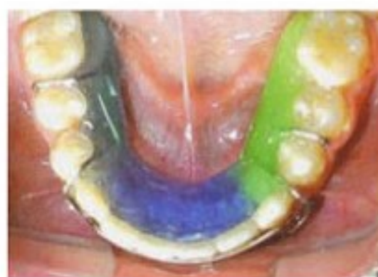
Figure 1. Hawley Retainer. 8

Several disadvantages come to mind such as wires passing over the occlusal surfaces that interfere with occlusion and prevent the setting of the teeth and the dependence on patient to wear and clean the retainer as directed. They are laboratory time consuming construction. The gripping hooks can be damaged and modify the occlusion of patient. Anti esthetic. Speech is impaired. Due to continuous use, the retainer can change color and absorb bad odors. 6,8