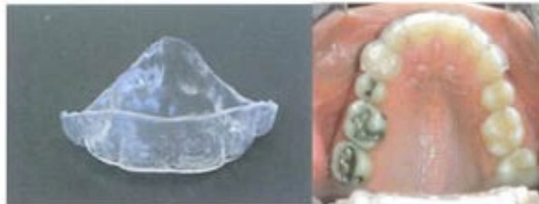
Figure 9. The Essix type A. 6

well, but are more resistant, type "C" are used for night use molar to molar, to maintain a palatine expansion, useful in patient that grand their teeth, as space maintainers. 6 Advantages of Essix are highly esthetic, easy to make, comfortable, cheap, the Essix "C" can be used as a tray for dental bleaching and can be sectioned for space closure. Disadvantages of Essix are the Essix "type A" lasts about 6 months, the Essix "type C" lasts about 12 months, the Essix "type A" is not recommended for palatal expansion maintenance. 6