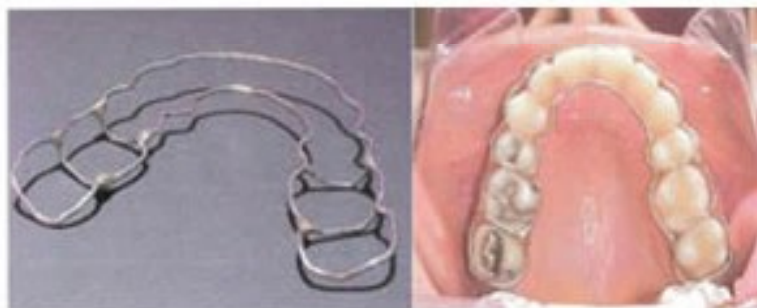
Figure 5. Sarhan or all Wire Retainer. 4

We depend upon patient compliance for use. Rebound correction like rotation, diastemas, proclination, intrusion with retainer are difficult.