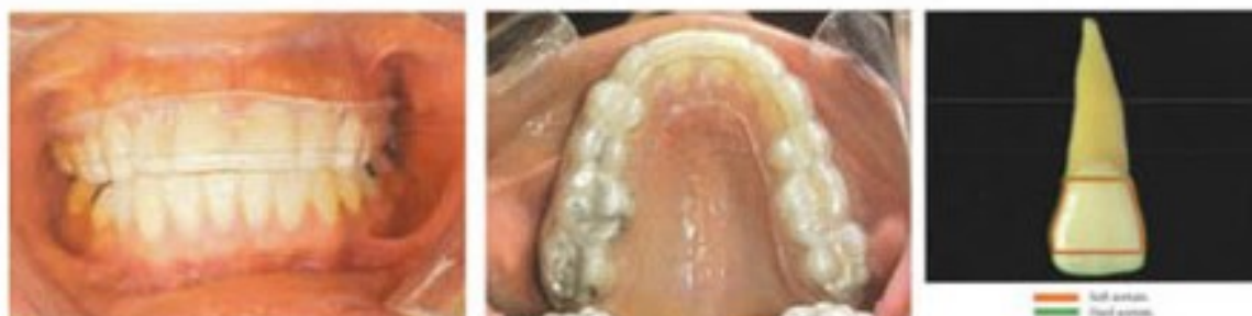
Figure 8. Osamu retainer. 6

Advantages of Osamu retainer are esthetic, hygienic, well accepted by patient, it has good retention. Disadvantages of Osamu retainer are produces a slight open bite, it consumes laboratory time, it may fracture under occlusion pressure, it depend upon patient compliance for retention, it last about 8-12 months, due to continuous use it can change color and absorb foul odors.