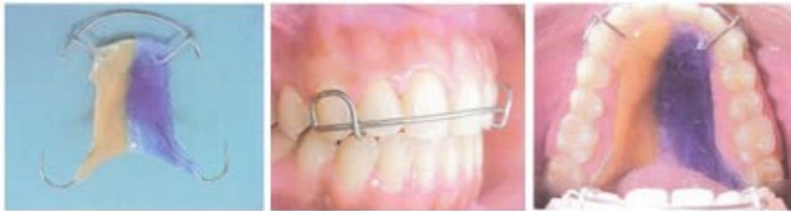
Figure 4. Van der Linden Retainer. 4

Disadvantages of Van der Linden are it depend upon patient compliance for retention and cleaning. We need to invest time in the laboratory. Anti esthetic. It impairs speech. Because of the continuous use, the retainer can change color and retain foul odors. 4