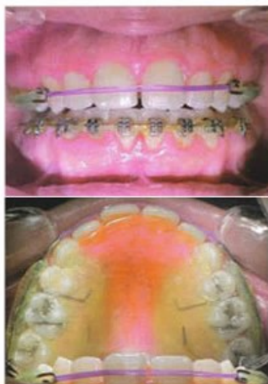
Figure 3. Elastic Wrap Around. 6

Disadvantages of Elastic wrap around are it depends upon patient cooperation. Space closure is difficult to control. Speech is impaired. The retainer can dislodge if the elastic worn is too heavy. 6