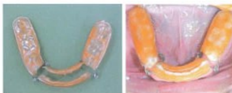
Figure 7. Coregg retainer. 6

teeth tip and torque is maintained, in block space closure is obtained, these are excellent long term retainer, it allows syndesmothomy, dan it is lasting retainer. Disadvantages of Coregg retainer are it takes a long time to make, it is not esthetic, absorbs foul odors, with continuous use the acrylic changes color, the acrylic can fracture under occlusion pressure. If it is not well made it can provoke an open bite. Unadjusted loops can hurt the oral mucosa. 6