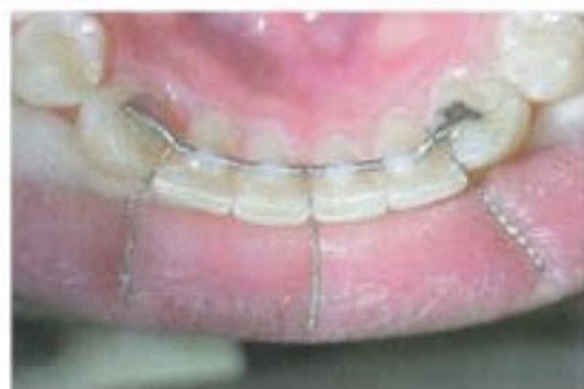
Figure 12. Prefabricated Fixed retainer. 6

This type of retention is used when a prolonged retention is planned or when we fear that teeth alignment is instable. Lingual fixed retainers in mandibular arch do not interfere with occlusion. However, sufficient overjet is required for the placement of fixed bonded wires on the lingual surfaces of upper incisors so that the fixed retainer does not interfere with the occluding lower anterior teeth. In the upper arch, bonded wire fixed retainers are often used to retain closed diastemas between the upper central incisors. 2,4,8