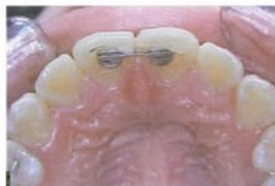
Figure 14. Fixed retainer in upper arch to retain a closed diastema. 6

Lower inferior retainers can be left until growth is completed and for two years in adult. After this, an individual decision must be taken for its removal. There are two type of additaments for fixed retention : prefabricated and adapted to the patient. Prefabricated, there is a great variete of brands and models. Some of these lingual bars have two bases soldered to a 0,036" wire. There are different lengths. These bases are bonded to the lingual aspects of the canines.