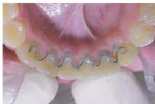
Figure 13. Fixed retainer. 6