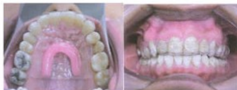
Figure. 11 Reinforced Essix. 6

later on two hours in the afternoon and nightly use is enough. Not recommended in cases of dental rotations. 6 Advantages of Reinforced Essix are esthetic, hygienic, cheap, easy elaborate, well tolerated, due to its rigidity it can maintain any palatal expansion. Disadvantages are it lasts about 6 to 8 months, the anterior segment can fracture. 6