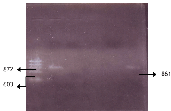
Figure 3. The PCR result of subject III; Column 1: Alkali measurement marker Lambda DNA \Phi X174 Hae III; Column 2: DNA positive control; Column 3: DNA negative control; Column 4: PCR result from twice smeared DNA template (Tube I); Column 5: Four times smeared DNA template (Tube II); Column 6: Six times (Tube III).

III were amplified using PCR technique. The result was electrophoresised in agarose gel 1% with ethidium bromide coloring and then visualized under Ultra Violet Transluminator and photo imaging was conducted. The PCR result image which had been electrophoresised in agarose gel 1% for each subject is displayed in Figure 1, Figure 2, and Figure 3. In each figure, the 1 st column shows the alkali measurement marker that is cut plasmid \Phi X174 using restriction enzyme Hae III (lambda DNA \Phi X174 Hae III) so it produces DNA fragments for 1353 pairs of alkali (pb), 1078 pb, 872 pb, 603 pb and 310 pb. In each figure, the amplified DNA strands by PCR technique will be displayed in measurement 861 pb which is placed