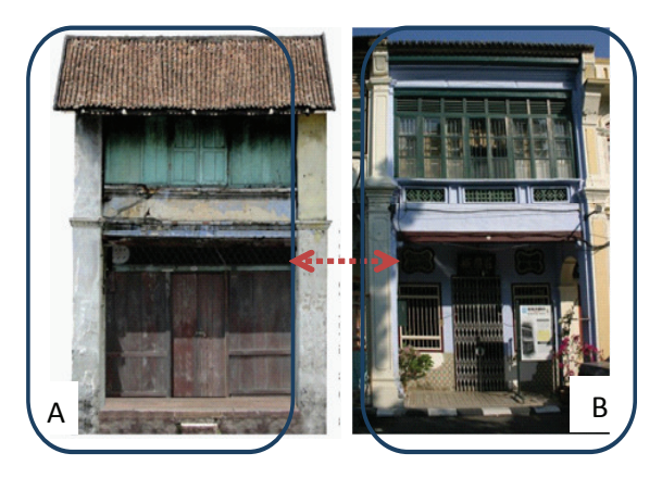
Figure 9: (A) Early Penang Style with timber and attap (B) Sun YatSen/ Southern Chinese Eclectic /Source: penangshophouse.com.my, 2015 Modified By Author