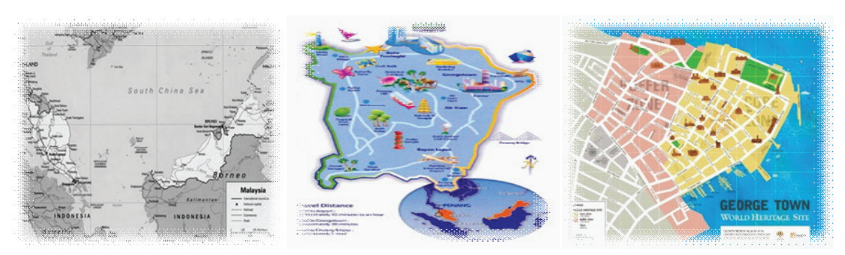
Figure1: Map of Penang Island, Core and Buffer Zone of UNESCO World

It is observed that the unique type of architectural values of structure in George Town clearly exhibits the influence of Chinese, Malay, Indian and European styles (Figure 2). All of this mixture found to be matured and merged in response to the local and the environment. From Chinese