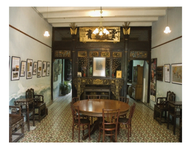
Figure 8: A hall after The Entrance Backlit by Courtyard

The Municipal Commissioners of Penang State have come up with a new regulation for those who want to build a new shophouse. The purpose is more towards safety cautious due to the past massive firing incident over shophouse. The new mandates from the Municipal Commissioners of Penang for the new shophouses have been detailed out, but briefly mentioned here as follows by which the shophouses must be built with bricks, plaster coat and roofed with fire proof tiles instead of wood or attap that which was commonly used before (Figure 9). This mandate was officially executed immediately after a tragic fire happened in the shophouse in 1814. Generally, the second level of shop-