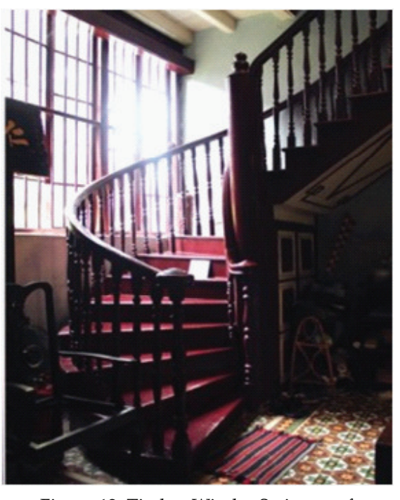
Figure 12: Timber Winder Staircase of Sun Yat Sen Museum

There's just another interesting feature of shophouse wherein one could find a corner with an atrium-like indoor outdoor room with some kind of the grandwinder staircase that leads to the family's rooms in the upstairs level (Figure 12). The