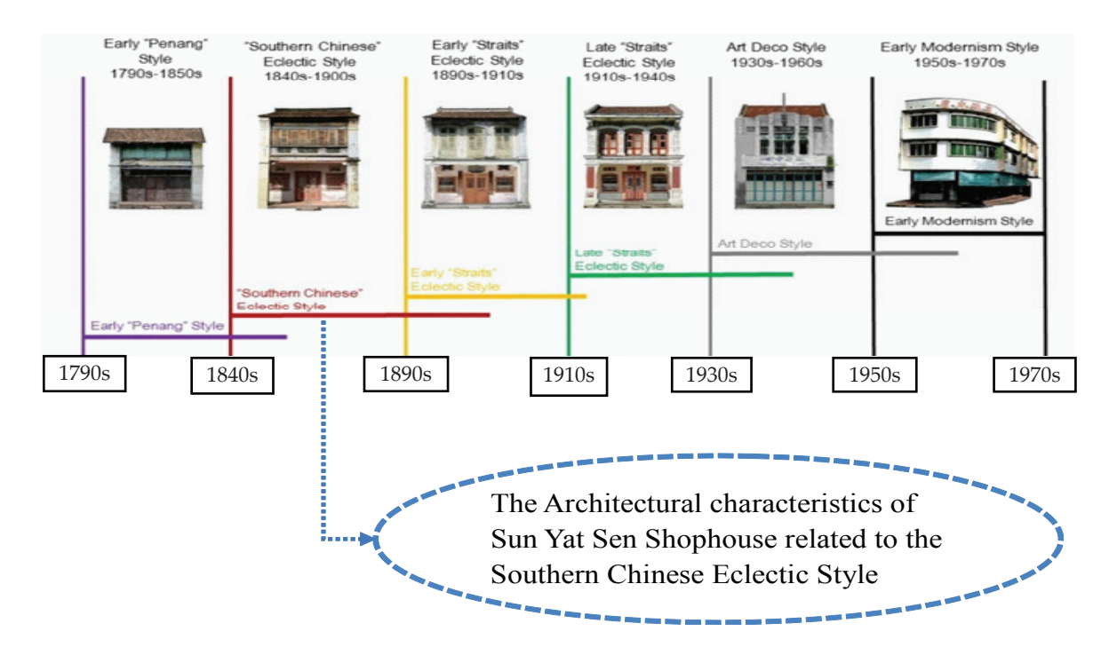
Figure 5: The period of shophouses were classified by Penang Heritage Trust http://penangshophouse.com, 2015 Modified by Author

However, the term shophouses in most of the countries in Southeast Asia refers to multiple levels building. Likewise, the ground level is especially reserved for commercial activities whereas the remaining floors are as a residential place. But this is not an ideal case in Penang whereby