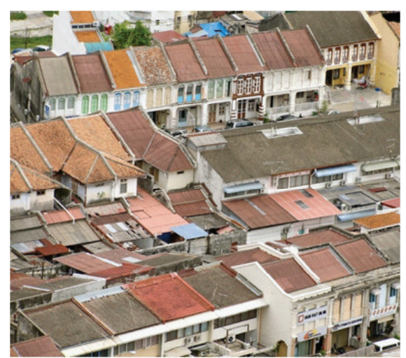
Figure 4: Physical Appearance of Shophouse in George Town, Penang

between openings, the spaces above the arched transom and below the openings were decorated with plaster renderings such as bouquets of flowers, fruits, mythical figures and geometrical shapes. In addition, some of the window or door panels were beautifully carved. These decorations among other things reflect not only the wealth of the owners or tenants, but also