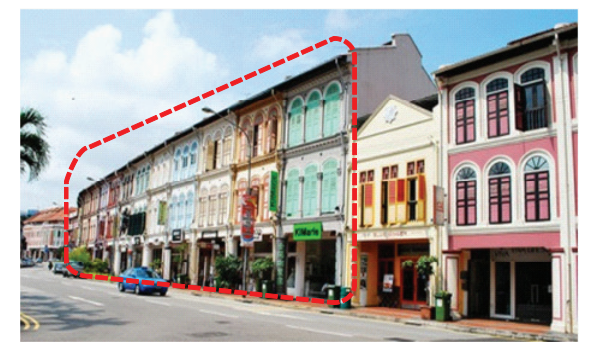
Figure 3: Continuous Row of Windows Source: http://penangshophouse.com.my/, 2016 Modified By Author

Subsequently, the straits eclectic style developed with the breaking of the facade into two or three moulded openings. Such style became popular among the Baba-Nyonya (Peranakan Cina) eclectic style community in either Penang or Melaka. In some shophouses, the pilasters placed