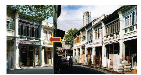
Figure 6: The Façade of Sun Yat Sen along Arminian Street. Source: http://www.oocities.org/armenian_pg/ history.htm 2015 - Modified by Author

a shophouse could purely be residential place and sometimes might be termed as a terrace house too (Knapp, 2010). Thus, as in the case of 120 Armenian Street, it was designed mainly for residential purpose. The unique Chinese form of shophouses was resulted from the local influences and colonial's modification in an attempt to adapt to tropical climates.