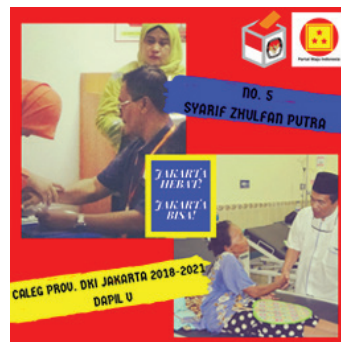
Figure 8. Sixth Day Campaign Material

According to the DKI Jakarta PMI data in 2017, the number of patients who needed blood from year to year continued to increase. Hearing the news, I was moved to help the patients by donating in hospital in Duren Sawit to illustrate my love for all residents of DKI Jakarta. On Saturday, March 17, 2018, I also invited the patients to talk about their complaints regarding the services available in DKI Jakarta.