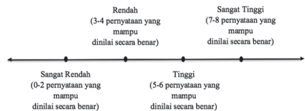
Figure 10. Political Knowledge Levels

From the table above, it can be concluded that respondents from treatment group obtained a higher score than respondents from control group. Data about the number of questions which were scored correctly was categorized by the researcher into four levels of political knowledge, which are very low, low, high, and very high. The following is an illustration of the level of political knowledge.