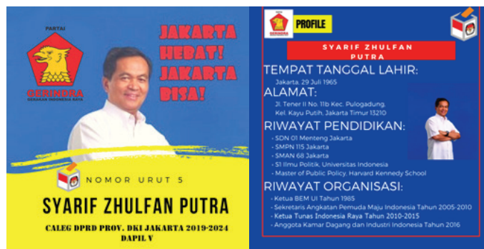
Figure 3. First Day Campaign Material