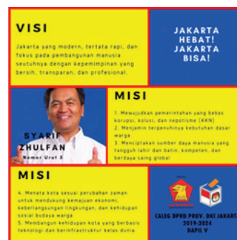
Figure 4. Second Day Campaign Material