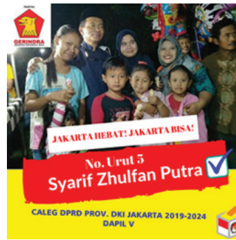
Figure 7. Fifth Day Campaign Material

Based on the data acquired by DKI Jakarta Regional Government in 2017, a large number of DKI Jakarta residents work as traders. I think the entrepreneurs in DKI Jakarta make a very important group due to their capability to improve DKI Jakarta with creativity and innovations.