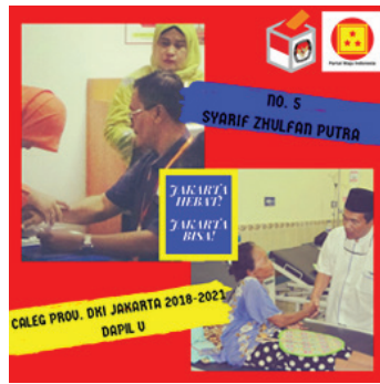
Figure 9. Seventh Day Campaign Material