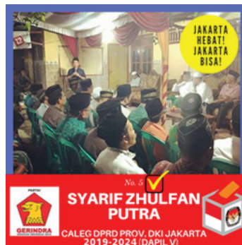
Figure 6. Fourth Day Campaign Material

In order to accomplish my campaign to become a member of the DKI Jakarta Legislative Council for 2019 -2424 period, on Thursday, March 15, 2018 at 7:00 PM, I invited all community and religious leaders in the District V to ask for their blessings. We did not forget to pray for a better DKI Jakarta that could become an advanced, modern, and prosperous city. This activity also aimed to establish a close relationship and capture the aspirations of community and religious leaders.