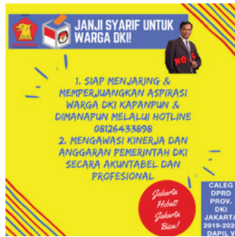
Figure 5. Third Day Campaign Material

Being a member of the DKI Jakarta Legislative Council is a big responsibility.