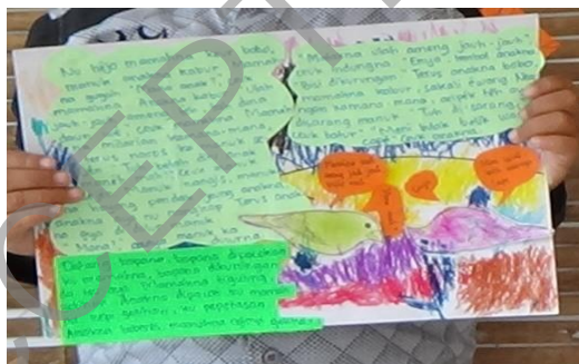
Figure 3. Publishing the story.

Finally, the last step was the publication of the story. In this step, it was conducted in the form of storytelling.