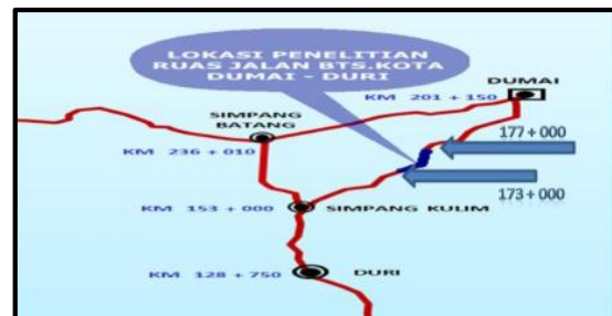
Figure 1. Map Location Research