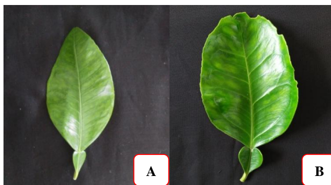
Figure 2. Character of Leaf Lamina Margin Pamelos Giri Matang Aceh, Indonesia.entire (A.); Crenate (B).