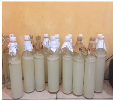
Figure 2. Starter Nata de Legen produced by participants

The second phase of this training was conducted 7 days after the participants made the starter. The result was shown in Figure 2. From 15 participants, all could produce the Nata de Legen starter well. There was no contamination, nata formed in the surface of the bottle was 1 cm thick, the medium became cloudy and smelled sour.