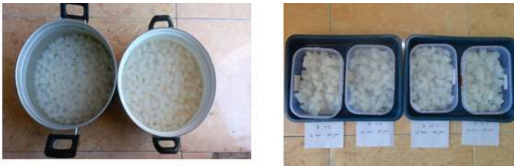
Figurer 4. Post harvesting production: Nata cut into rectangles (A) and whitening of Nata de Legen (B)

Nata formed in the trays were immediately harvested and washed with water to remove the sour odor. The lowest layer of Nata was also removed to eliminate remnants of the media. The Nata then cut into cubes or rectangles of appropriate size (generally 1x1cm) and the Nata was then soaked in water for whitening and reducing sour smell for 3 days. Every day the water was replaced before the next process, those were pressing and bleaching. Bleaching was done by soaking the Nata in 0.5% caustic soda (NaOH) solution for 24 hours. Nata was washed many times until the alkali properties disappeared (surface was not slippery) and the pH had returned to neutral (pH 7). Soften Nata was indicated if it was tearable or lose fiber when bitten. The bleached and softened Nata was then boiled and ready for the finished product (Figure 4)