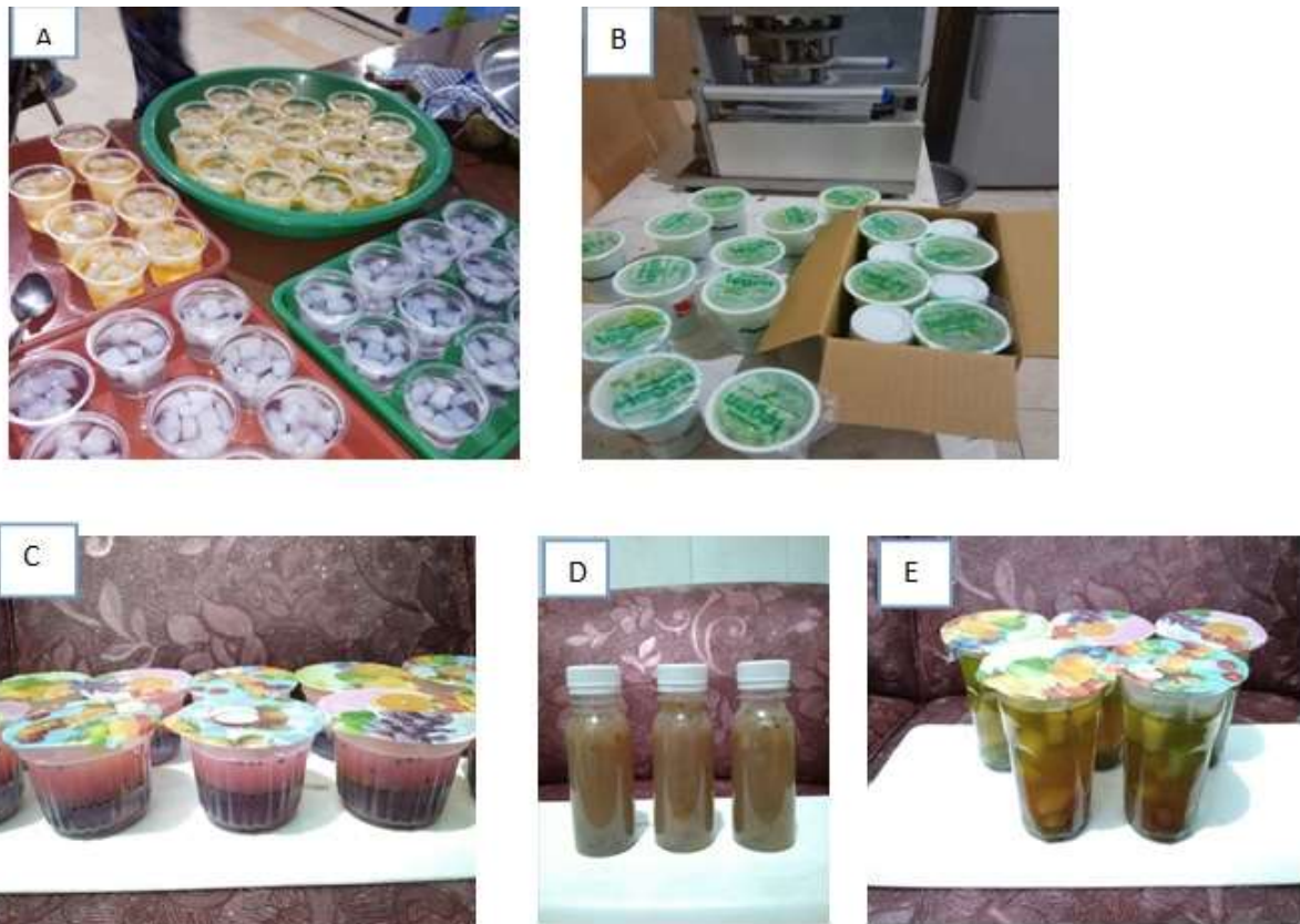
Figure 5. Various processed products (A. nutrijel Nata of various flavors. B. Honeydew flavored drinks C. Mixed flavor Nata jelly D. Pudding drink and E. Fruit mixed Nata drink

The results of direct practice of making Nata de Legen were then processed to become food and drink. Food and beverage products made were desserts and beverages that were much preferred by people. The beverage products fruit-flavored Nata drinks such as oranges, strawberry, cocopandan and honeydew. Nata de Legen was mixed in syrup and water typical of children's favorites. Besides that, participants were also taught to make jelly or Nata de Legen pudding with various colors and flavors with additives such as food colorings and preservatives according to standards of government regulations, and packaging was using cup sealers and hand sealers. Pictures of beverage and food products that were trained as shown in Figure 5.