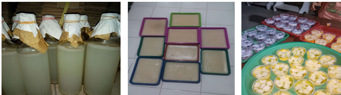
Figure 1. A. Starter Nata de Legen , B. Nata de Legen , C. Examples of Nata de Legen beverage products produced at the preparation stage

The next preparation stage is the trial of making Nata de Legen with starter produced from Legen medium. This stage was conducted in UNESA Microbiology Laboratory with good results obtained. Nata de Legen produced had tender texture, light brown (cream) color with a weight of 800-900 gr / liter medium and thickness of 1 to 1.5 cm in 7-9 days incubation. The trial of making beverage products was conducted in UNESA Microbiology Laboratory by making simple drinks and desserts in form of fruit-flavored Nata and Nata pudding to give example for participants and to motivate their creativity.