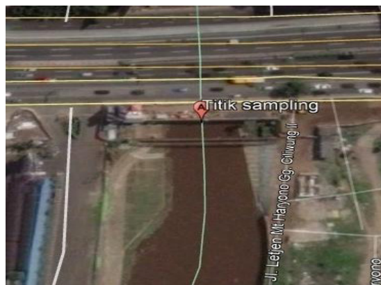
Figure 1. The samples collection location with the coordinate of 6°14'36.50"S and 106°51'45.03"E

The plecostomus fish were collected from Ciliwung River, Jakarta, exactly at Jln. Inpekki Ciliwung Letjen MT. Haryono Gg. Ciliwung, Cawang, East Jakarta (Figure 1). The samples collection were conducted from 26 August-22 September 2017. Plecostomus were caught using nets and were put into containers.