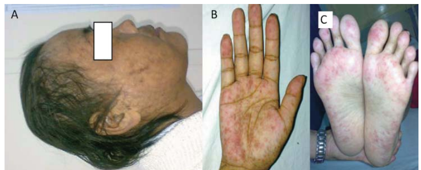
Figure 1 A. Lupus hair and photosensitivity. B & C. Vasculitis of palm and soles

The results of physical examination were as follows. She looked older than her stated age, emaciated and lethargic, mental state was somnolent, blood pressure was 104/60 mmHg, pulse rate was 120 times/minute, respiratory rate was 32-36 times/minute, and body temperature was 38.8°C. She had no lymphadenopathy. On head examination, there were alopecia areata (Lupus hair), pale conjunctiva, malar rash, and oral ulcer. There was no abnormality detected in ears, nose, and throat. On lung examination, the main respiratory sound was vesicular breathing in both lungs. there were rales in right and left thorax, decreased breath sounds, pleural friction rub in left thoracic, and there was no audible murmur or pericardial friction rub. The abdomen was supple on palpation, but we found the chessboard phenomenon and tenderness. The liver and spleen were not palpable and intestinal sound was normal on auscultation. On the extremities, there was vasculitis in palm and sole. There was not any arthritis or oedema.