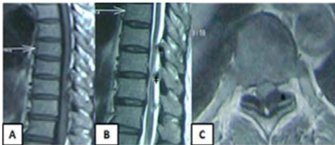
Figure 1 A. T1 weighted MRI of thoracic spine showed continuous OLF between T9–11. B. T2 weighted MRI showed OLF (double dagger). C. Canal stenosis on Axial T2 weighted image due to OLF (asterisk)

A 48-year-old male presented in our spine outpatient clinic complains of weakness of bilateral inferior extremities that gradually worsened over a period of ten years. On admission his muscle weakness 3/5 and hypaesthesia below the dermatome Th 11 was revealed. The reflexes were hyperactive in the lower extremities. Deep tendon reflexes were increased at and below the bilateral quadriceps femoris with myoclonus bilaterally. There was no urinary or bowel dysfunction. Plain x-rays of the thoracic spine failed to demonstrate any specific abnormality.