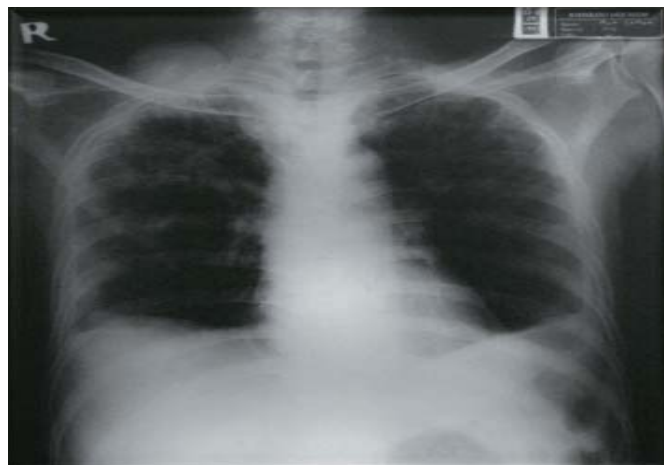
Figure 1. Bilateral Pleural Effusion

meq/L. Chest x-ray showed chronic active tuberculosis of the lungs with bilateral pleural effusion (Figure 1).