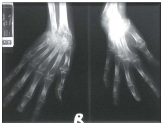
Figure 2. Radiologic photo of hands with osteomyelitis

Plain film of right manus region gave an impression of septic arthritis of the right wrist joint with subluxation of distal segment of radiocarpal-ulnecarpal joint to the volar and ulnar sides, deformity of distal phalang of third finger, disused osteoporosis of manus bone, and calcification of soft tissues in volar side of distal antebrachii. There was also destruction in a third distal part of radius-ulnar (epi-metaphysis), carpal, and metacarpal, with less defined borders. Joint space was narrowing. These appearances were concluded as osteomyelitis (Figure 2).