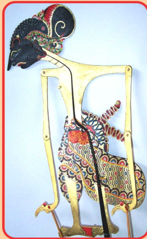
Wayang Kulit, Yudhistira alias Samiaji

Jurnal Pendidikan Sains Sosial dan Kemanusiaan