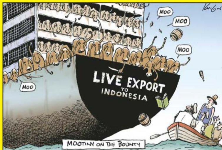
"Cartoon of Cattle Export"

International Journal for Historical Studies