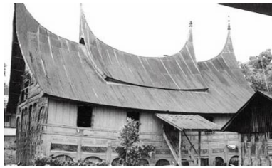
Figure 2. Rumah Gadang Gonjong Ampek Sibak Baju