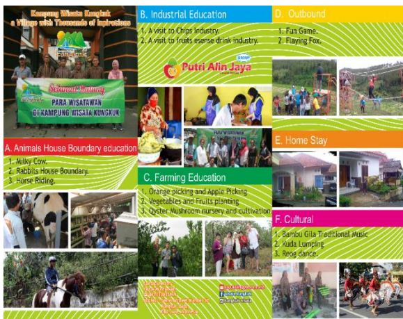
Figure 6. Sample of Brochure Made by Badawis Community

Besides product presentation, the participants were also trained to design a brochure introducing and promoting their own area of resources. Figure 6 shows the example of the brochure they have made.