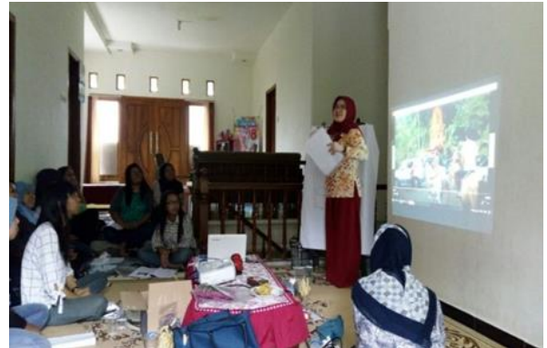
Figure 2. Activities on Handling the Guests

In Doing, the training was conducted with around twenty participants who enthusiastically join the program. Most of the participantas are the youths from Kungkuk village. Figure 2 describes the activities on handling the guests. After having some theories on handling the guests, all of the participants practice handling the guests in pairs.