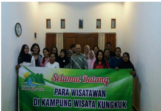
Figure 8. Badawis Staff and the local young people

The high commitment of all stakeholders in the tourism village, including the village chief officials, Pokdarwis, farmer groups, BKM, and Batu Guide Center (BGC) to work together to continue the activities of Tourism and language Awareness is autonomously associated with community development projects.