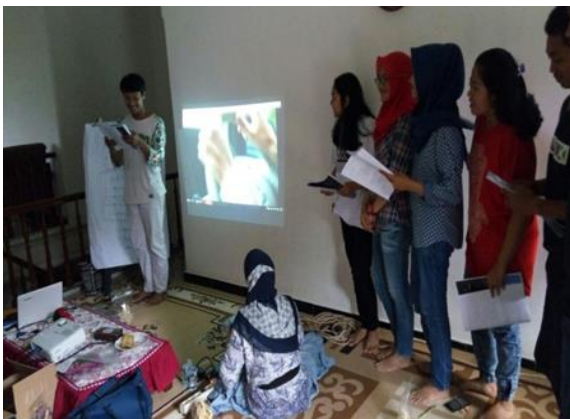
Figure 5. Practices on Product Presentation

In the language training, the participants learn how to present the product in English. They have to be able to apply the theories of product presentation and present it in front of their friends. The other participants give questions and comments on the related presentation. Figure 5 shows the training process.