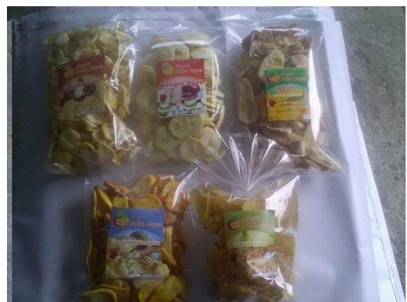
Figure 4. Fruit Chips in Different Packages