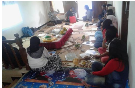
Figure 7. Activities in Brochure Making

In addition to designing the brochure, they have to be able to present what is inside the brochure. Figure 7 shows the activity.