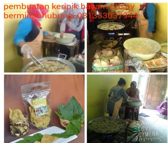
Figure 3. Process of Making Fruit Chips

Besides handling the guests, the participants also learn about presenting Batu products such as promoting fruit chips and designing a brochure. Figures 3 and 4 describe the activities respectively.