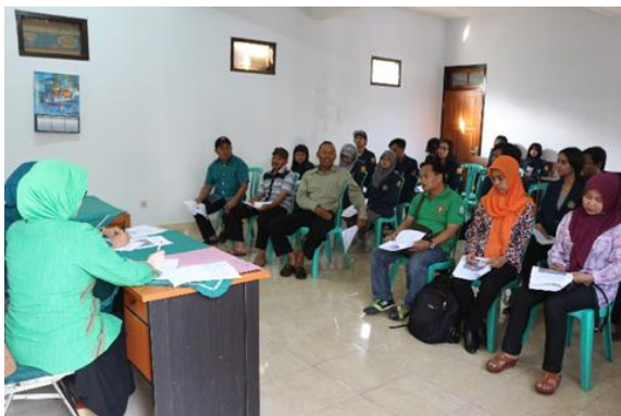
Figure 1. Gathering and Discussion on the BADAWIS program

In planning, a series of activities such as making an appointment with the contact person, preparing the modules and teaching materials are prepared at this stage. The activities are conducted by inviting the two parties namely, a group of tourism awareness consisting of the youths, and a group of senior villagers involving strawberry, apple, orange farmers and some homestay owners. Figure 1 shows the dissemination of the program attended by the two parties.