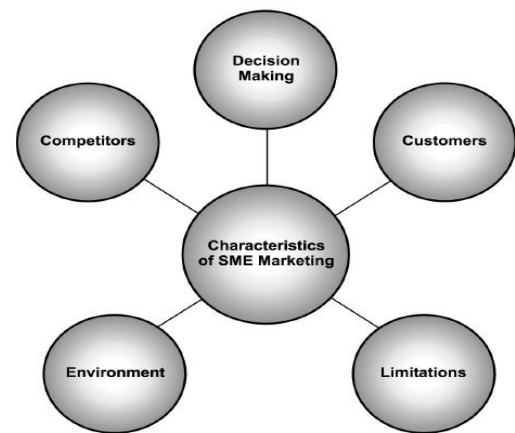
Figure 1. Characteristics of Small Business Marketing

The essence of marketing for small business according to Grant et al. (2001) is the experiential knowledge on how to optimize their business processes. Comprehensive experiential knowledge becomes an alternative strategy to continuously provide benefits in the long run. The combination of the characteristics of small businesses will help to improve their competitiveness through marketing initiatives that can provide greater value for the benefit of these small businesses.