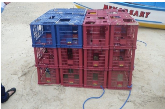
Figure 4. A unit of fish apartments