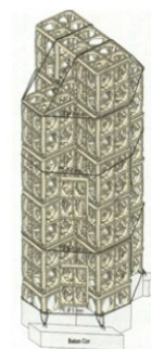
Figure 2. Sub-part of fish apartment design

Shelter is a component made of chunks or pieces of rope nets as media attachment of eggs, larvae, and juvenile fish. Ballast is a component made Daric or cement that will function as a stabilizer so that the frame of the apartments can stand upright and do not move because of the current.