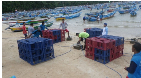
Figure 6. Four units of fish apartment

The condition is possible due to lack of ballast in each unit FADs/apartments fish. Therefore, in the manufacture of fish apartment is equipped with a ballast which is believe to be quite capable of overcoming the current is quite strong.