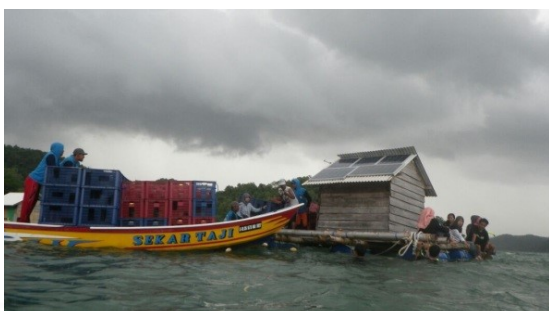
Figure 5. Setting the sinker to the fish apartment

Location of the apartment of fish is a location that has a fairly strong currents. According to the local government, several times FADs were installed at that location drifting. Here is a picture of mounting a weight on the apartment units fish: