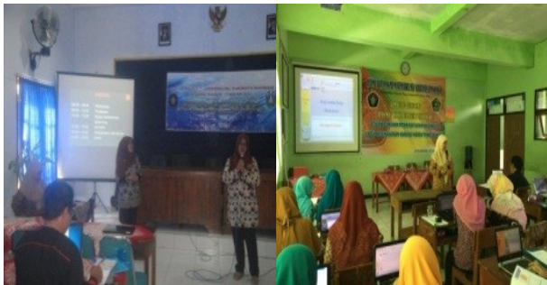
Figure 2. The Participants Followed the Explanation of the Presenter

recognize the microsoft mathematics. Most of the participants could follow the explanation and installed the Microsoft Mathematics well. However, there was some participants who still just learning in using a laptop, so there was few difficulties in operation of Microsoft Mathematics. Figure 2 is a documentation of training activities.