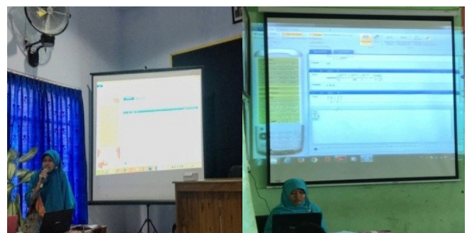
Figure 4. Participants Presented the Results in the Form Exercises Worksheet

To measure the success level of this activity, evaluation to the participants and activities were conducted. The evaluation to the participants were: work on a worksheet according to the instructions on the module reaches 70% correct. From the training results, 94.3% of the MTs Mathematics teachers and 100% of SMP Mathematics teachers were doing the worksheet according to the instructions and correct. The evaluation of the training activities for Mathematics teachers of MTs and SMP in Ponorogo is considered highly successful as participants registered were all present and following the activities with the necessary requirements and expect a sustainable activity (100%). Therefore, the results of research evaluation is considered very good. Figure 4 is a documentation of participants presented activities.