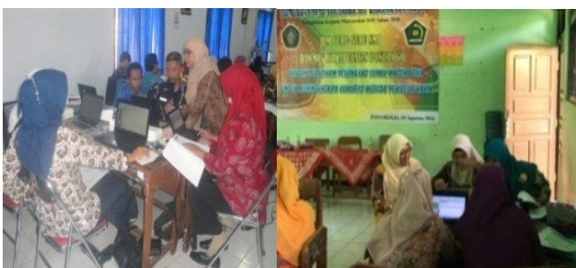
Figure 3. Group Learning Process Atmosphere of Installing Microsoft Mathematics and Exercises

Furthermore, participants learned in groups following the Microsoft Mathematics guide modules and completing exercises using Microsoft Mathematics. Exercises were taken from the national exam question bank areas of mathematics and statistics. Some exercises can be directly solved by using the features of Microsoft Mathematics. But most of the exercises given were matters that require logical thinking in finding solutions. Exercises that have been done were stored in a worksheet that must be collected to the IbM team and as a replacement posttest on the internal final evaluation. Figure 3 is a documentation of group learning activities.