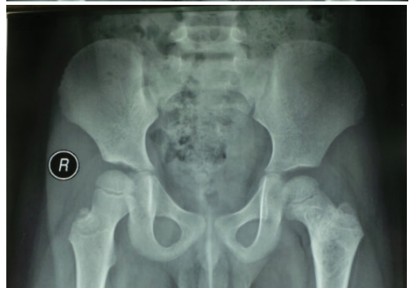
Figure 2: Hip X-Ray of PSI therapy in SBC patient: A. Before surgery, B. Month 6 after surgery, C. Month 12 after surgery.

Three of 5 patients in curettage combined with HA came to us with pathological fracture. After having curettage and HA, the fracture was stabilized with internal fixation. All cases in this group with or without pathologic fracture demonstrated complete bone healing (figure 3). This result was supported by previous study which showed 100% complete healing with this treatment. 20