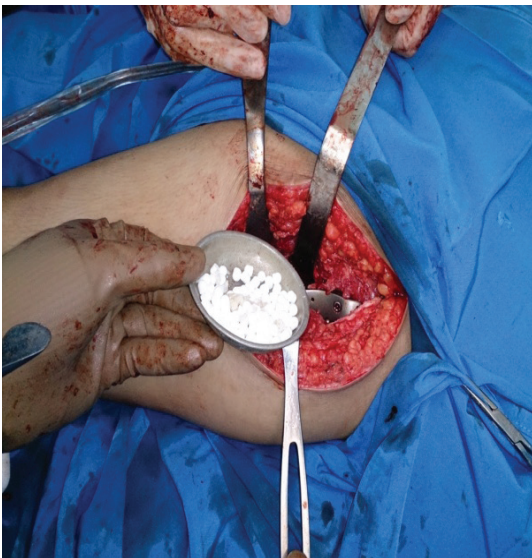
Figure 1: Intra-operative therapy with: A. PSI and B. Curettage with HA

In the PSI group, 3 of 5 subjects had SBC in the proximal femur, 1 in proximal humerus and 1 in calcaneus. All subjects in this group showed a complete bone healing. Complete bone consolidation was evaluated radiographically (figure 2). 12,13 This result was similar to study conducted by A. Hashemi-Nejad and Cole. 13 However, they concluded that the healing response of PSI is unpredictable and usually incomplete even after the repeated injections. Some studies reported that PSI highly reduced the amount of the cyst volume. 12,20,21