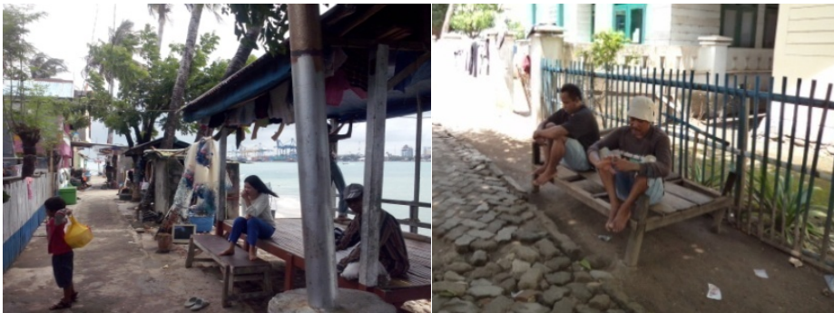
Figure 2. Communal Space Created by the Street Side

The beach area is a communal space that is used as a parking lot for boats, manufacture and maintenance of boats / ships, for play, to socialize, for exercise, recreation, and even control the environment that might be affected by newcomers. There are several bale-bale in the area, almost all of them placed near the trees to get shade and fresh air. The illustration of communal space in Lae-lae island can be seen in Figure 2.