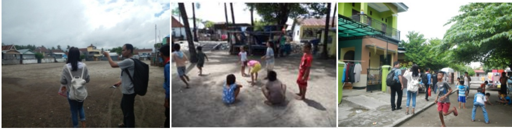
Figure 3. Football Field and Green Open Spaces