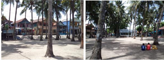
Figure 6. Green Open Space Used as a Playground and Camping Area

Pedestrian signs are planned with the aim of enjoying the beauty of the beach and enjoying the sunset and sunrise while cycling or walking around the island. A beautiful view of the ocean with the roar of the waves always provides peace and comfort, especially for elderly tourists (Maryani, 2008). This is a kind of nature tourism or eco-tourism, to a place where nature is relatively undisturbed or contaminated (polluted) with the objective of studying, admiring and enjoying the scenery, vegetation and wildlife, as well as forms of cultural manifestations, both from the past and the present (Hani, et al 2010)