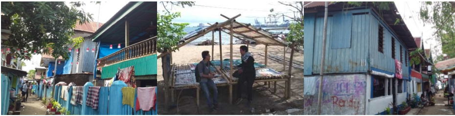
Figure 9. Nature Tourism

The Japanese cave has historical value. Based on research conducted by PATA in 1961 in North America, for more than 50% of foreign tourists who visit the Asia and Pacific regions, the motivation of their travel is to look and see the customs, the way of life, historical heritage, ancient buildings and buildings of high value. According to the study Tourism Citra Indonesia in 2003, cultural tourism is the element that most attracts foreign tourists to come to Indonesia. Getting a score of 42.33 foreign tourists placed culture in the category of 'very interesting' and on top of other elements such as natural beauty and historical heritage, with a score of 39.42 and 30.86 respectively. This demonstrates cultural attractions as the most favored by tourists from tourism in Indonesia. Therefore, the condition of this Japanese cave needs to be re-organized to make it more attractive