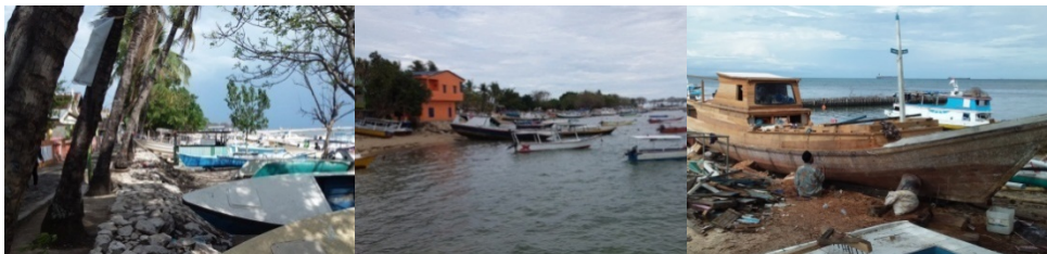
Figure 8. Social Life and Culture Tourism

In another part of the island, there is a Japanese cave which according to citizens' information was a Japanese relic cave, providing a passage to the mainland of Makassar city. But the condition of the cave is very poor, as it was used as a garbage dump by the local people. These items can be developed for heritage tourism. The illustration of social life and culture tourism can be seen in figure 8, while the nature tourism can be seen in figure 9.