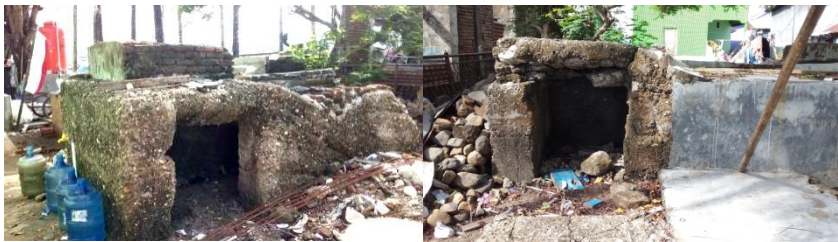
Figure 7. Japanese Caves as Cultural Heritage Tourism

Lae-Lae Island can also be developed for culture and heritage tourism, where the tourism can see and feel the state of the masses, habits, and customs, way of life, culture and art of the local people, besides the places that are considered sacred, called saukang , and caves. The Japanese caves in Lae-Lae island can be seen in figure 7.