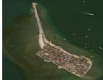
Figure 1. Lae-Lae Island

In their daily life, people on the island of Lae-Lae spend more time in open spaces. Various activities do not take place in the house but in the yard, the street, beaches, and other open places. Diverse activities are conducted in these places, where there are playing, working, resting, eating, parenting, or just socializing with neighbors. In these places, they put bale-bale as seats and the placement is generally under the big tree.