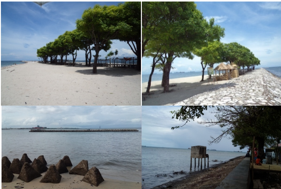
Figure 4. Sea Wall Which Developed into a Recreational Beach and the Row of Tammamate Trees

Currently, there are tourist attractions which are north of the island. Originally the area was a seawall intended for the protection of the Makassar city from the surf. Over the years, the west area of the seawall has experienced sedimentation and developed into the beach and is currently visited by many residents for recreation. There are several buildings made of bamboo lining the place and used by tourists for resting. Similarly, the row of tammamate trees / Jawa-jawa are giving shade and a comfortable atmosphere in the area. The illustration of sea wall which had been developed and the row of tammamate trees can be seen in Figure 4.