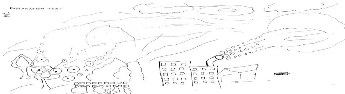
Figure 5. Nani's Visual Representation

Nani's visual representation of the explanation text (as presented by Image 5 below) was presented and considered to be a weak production, especially in the Explanation Sequence part of the task. It was predicted that this would impact on her ability to develop the processes of haze formation in her summary.