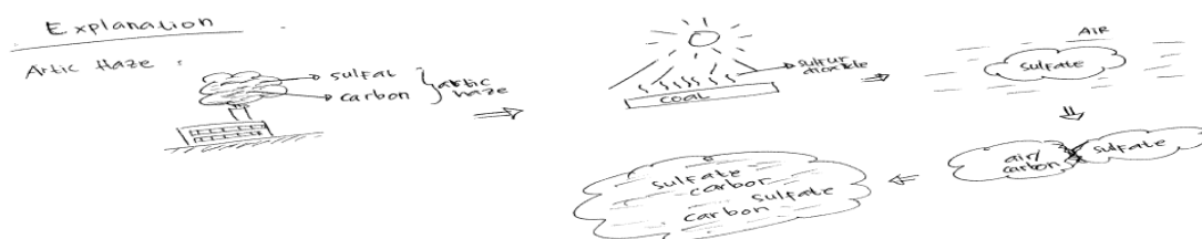
Figure 3. Jupe's Visual Representation

Based on the analytical framework, Jupe's production of the visual representation of the explanation text was not as productive as to Dina's visualisation (see Image 3 below), due primarily to one misinterpretation of the processes of haze formation.