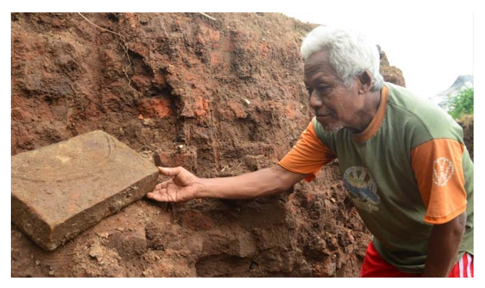
Picture 2. The Discovery of Archaelogical Site in Gumitir Village, District Mojokerto

truth, get a special treatment. Whereas in terms of site value, only found large bricks, and the surrounding community also never regarded the location as one of the sacred place for the citizens. This is different from Damarwulan site in Sudimoro Village where the site has been very visible and its existence has been preserved by the community. Unfortunately the actions taken by BPCB are so slow in handling the destruction of Damarwulan site. And no efforts from the Police of District Jombang to prevent site demolition.