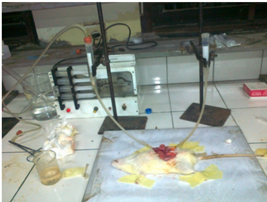
Figure 1 Rat with Perfusion Set

The solutions were mixed with aquadest and trichloroacetic acid (TCA) 8% and centrifuged for 10 minutes at 3000 rpm. To obtain the best result, the solutions were incubated in 37°C for 10 minutes or at room temperature for 25