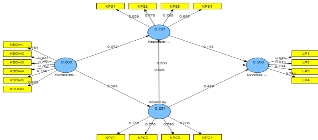
Figure 1.2 Diagram of Research Path