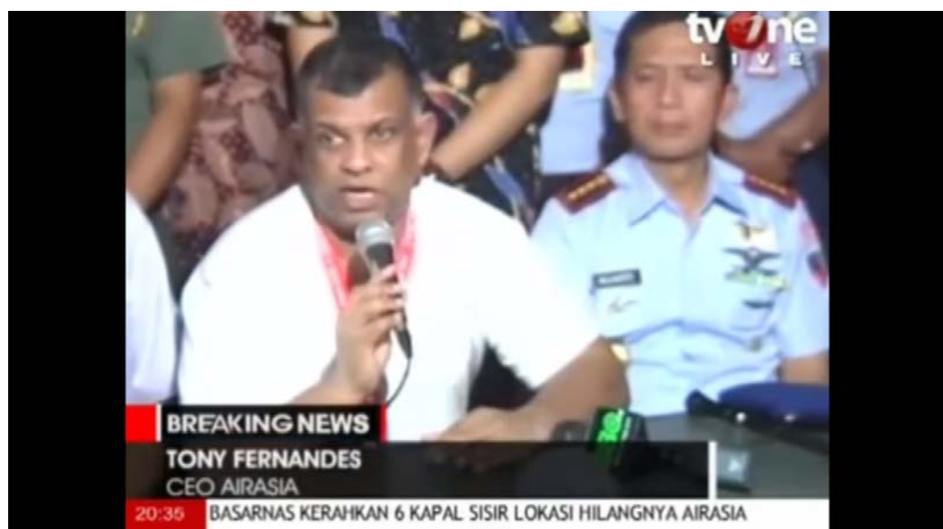
Picture 4.1 Press conference situation

AirAsia crisis team made press release after lost contact with their plane, it proved by press release December, 28 th 2014 that released four times.