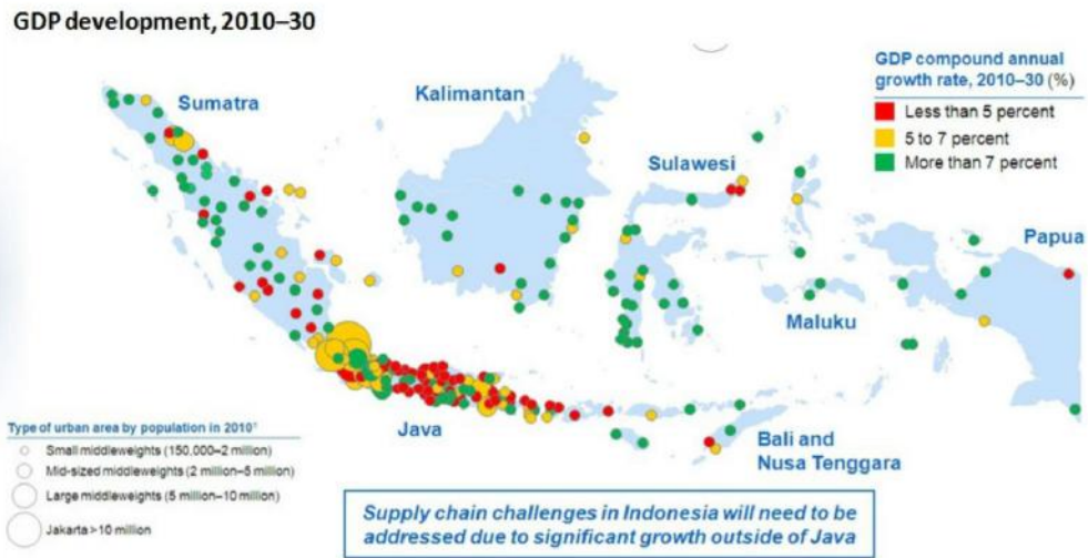
Figure 3. Indonesia maps with spread of population

Indonesia has grown rapidly, using its ports as gateways to enter / exit of the country; in other words the ports are most important for the social and economic well-being of the nation. The economic growth of