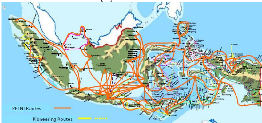
Figure 2. Nusantara Ship Route Network.

Almost all of the world’s shipping lines pass through Indonesian maritime territory. Unfortunately, no Indonesian port is in the primary international port category that is acknowledged globally as able to serve international mother vessels. With reference to the issue of the nation’s economy, Indonesia does not have a port system that is adequate in terms of performance and service, in the views of its users. In general, ports in Indonesia are lacking deep-water, missing out on private sector participation (investment) and are not competitive. Indonesia has a port system which is organized into a hierarchy system of approximately 1700 ports, including the 25 main ‘strategic’ ports (see figure 2).