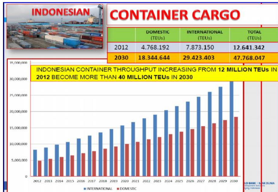
Figure 4 Forecast Indonesian Container Cargo 2012-2030[21]

Indonesia has been 5-6 percent during the last few years. The ports, as a gateway, have been facilitating economic growth (see figure 4).