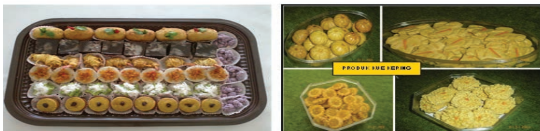
Figure 3. Lily Group’s Organic Cakes and Cook