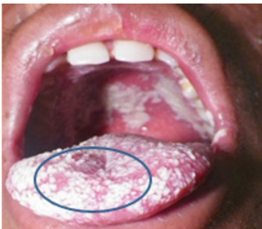
Figure 1. Oral candidiasis

From this study found that there were 40 non-ARV HIV/AIDS patients with anemia of chronic disease. Sumantri 9 stated that anemia in HIV/AIDS patients mostly was anemia of chronic disease. It was based on the process of adaptation or body's response towards the occurrence of disorder/infection. Table 1 showed the distribution of anemia in HIV/AIDS patients and the average of anemia severity found was from mild to moderate.