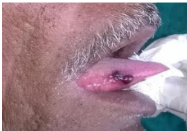
Figure 1. Photograph of the patient showing blood filled bullae on the right lateral border of the tongue

Methods of this case management started with routine blood an investigation including the