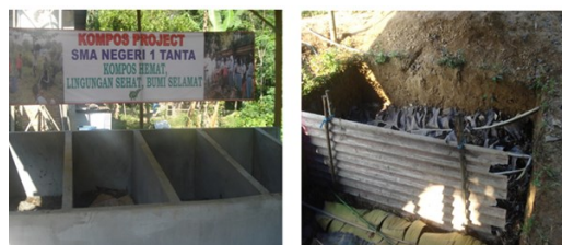
Figure2. Processing facility and initial Process

Composting process and sales activities through the market day in a mini-project activities are shown in Figure 2. and Figure 3.