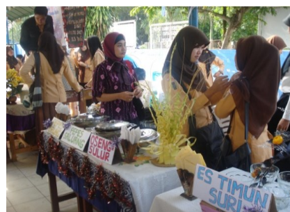
Figure3. Market Day

In mini project activities, teachers are able to make a list of Tabalong potential are culture, natural resources and others then present the results. Next stage teachers make a grand project design.