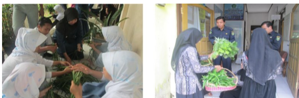
Figure 5. Post-harvest handling

Activities in the curriculum breakdown comprises: Formulation project syllabus, Making lesson plans each subject integrated with project activities, and application of lesson plan, documents preparation of the distinctive curriculum SMAN 1 Tanta.