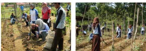
Figure 4. Organic Farm

Preparation of organic compost and organic pesticides, Handling during harvest. In the activities of the business day includes : Survey the market price and market share, Post-harvest handling and packaging, Promotion and marketing of organic farm. Organic farm activity is an application of Project Based Learning, which in this activity all the teachers and students involved in the project activities accordance with their respective sections. Organic farm activities are shown in Figure 4 and Post-harvest handling show in Figure 5.