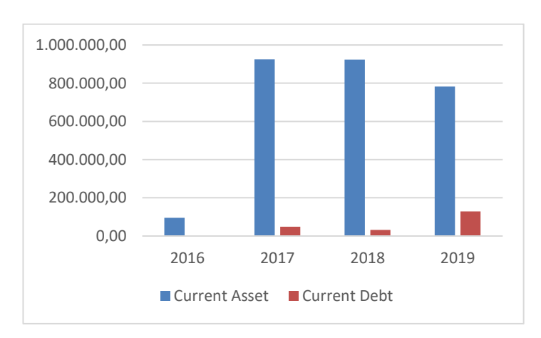
Figure 4.1 Graph of Current Debt and Current Assets growth (in millions of rupiah)

The company's financial performance measured through the Quick Ratio was very good in 2016, because the company's current debt was much smaller than current assets, then in the following year 2017-2019 it fell in the less good category, because the company's current debt experienced a very high increase.