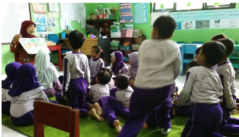
Figure 1.2 The teacher tells stories using picture media

From the observations during the storytelling activities, it is known that the children seem very happy to hear stories from their teacher. This can be seen from the very serious face that follows every scene in the story that is delivered.