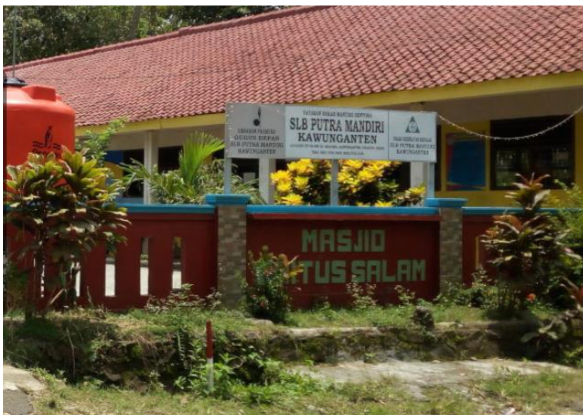
Figure 1. SLB Putra Mandiri Kawunganten

SLB Putra Mandiri Kawunganten is one of several special schools (SLB) in Cilacap, precisely in the Kawunganten sub-district. This school was established in 2015 and started from a concern for the many children with special needs, especially the mentally disabled and physically disabled, who