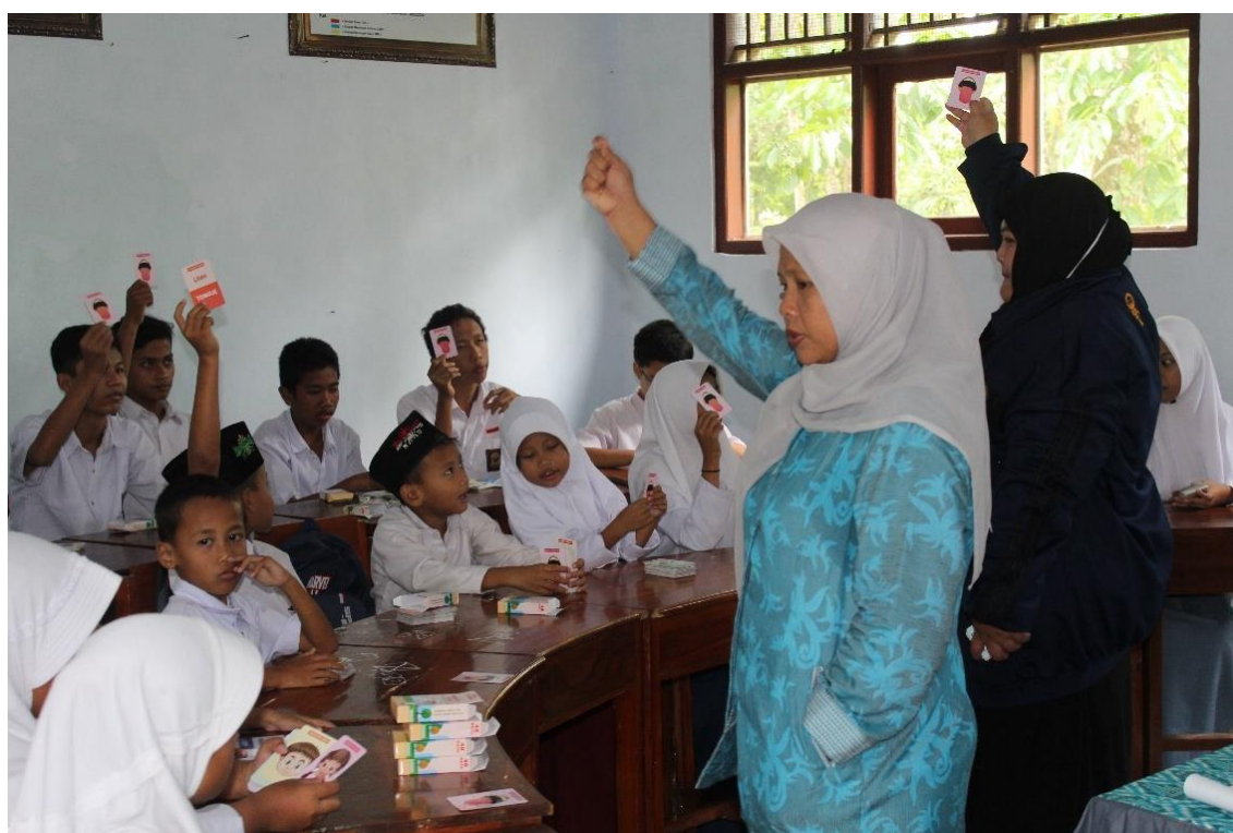
Figure 6. The use of flash card learning media in learning English