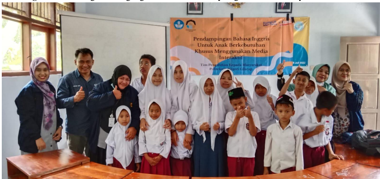
Figure 4. The English Language Assistance activity begins with a survey and discussion