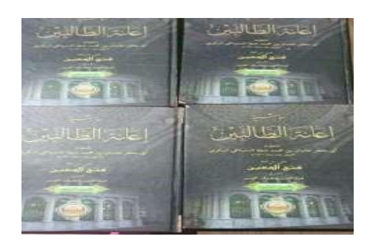
Figure 4 The Book of Figh I'Anatu Ath-Tholibin Volume 1,2.3 and 4

Informant IV's statement above about the book used by teachers at Islamic boarding schools is supported by an interview with informant I, on Wednesday, January 5, 2022 that: "The study of the yellow book that is studied at the Waratsatul Anbiya Islamic Boarding School at the Madrasah Aliyah level is the book I'anatu AthTholibin volumes 1,2,3 and 4. Class X uses Book I 'anatu AthTholibin volumes 1 and 2, Class XI Volumes 2 and 3 and Class XII Volumes 1 and 4 "