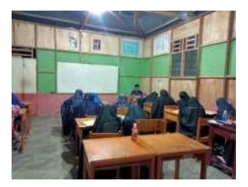
Figure 3 Observation of Jurisprudence Learning Activities in the Evening Class

"In learning the yellow book, learning Fiqh uses a variety of methods, now the ustadz is reading it and the students are listening and the students are asked to repeat the book that was studied, there are also methods using discussions or groups where students are assigned to study the book first. by asking seniors, and the next night the students appear in front of the class delivering material according to their respective group assignments, and there is also another method, namely by reading sentences directly interpreted and translated. And later asked students to repeat directly. We, as cottage teachers, do not make lesson plans except general teachers.