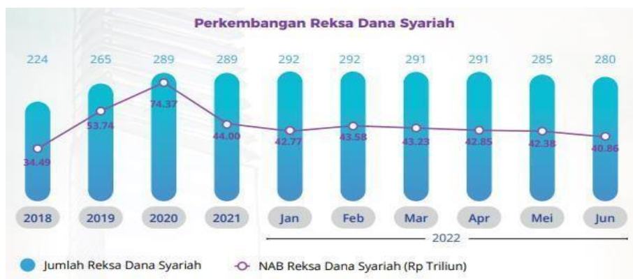
Figure 5 Development of sharia mutual funds in 2018-2022

The outstanding corporate sukuk of the public offering is issued according to the ijarah, mudharabah, and wakalah agreements. Table eight above shows green sukuk transactions are implemented using Sharia principles. Sales and purchase transaction contracts for green sukuk products use ijarah, wakalah, and mudhabah contracts. From 2021 to 2022, there will be an increase of 3.59% in transactions 2021. The contribution of green sukuk products issued by the government and private agencies participates in growth and development through Sharia capital market products. Sharia Mutual Funds (RDS) are mutual funds referred to in the Law on Capital Markets and their realization regulations whose arrangements do not contradict Islamic principles in the capital market. Sharia Mutual Funds are divided into several types: Stock RDS, Money Market RDS, Fixed Income RDS, Mixed RDS, Protected RDS, Index RDS, Foreign Securities-based RDS, Sukuk-based RDS, and Sharia ETFs. The following are the developments of Islamic mutual funds for the January – June 2022 period: