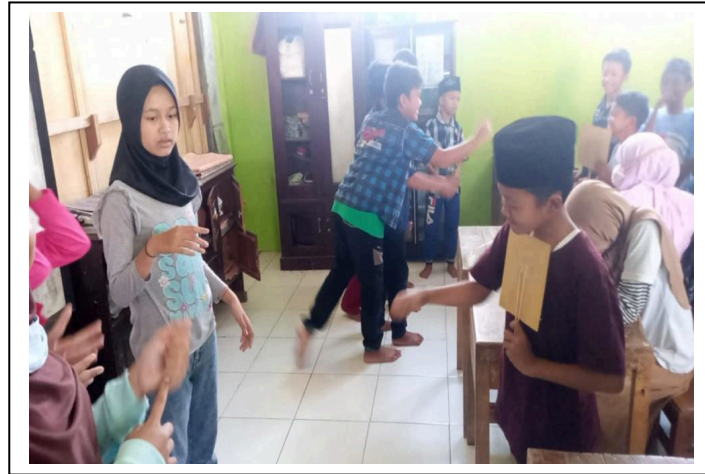
Figure 3. Young learners' engagement using puppet

relax leads to communication. According to Caganaga and Kalmiř (2015), puppets can aid in the development of conversational abilities because youngsters feel more at ease talking with a puppet than with a teacher. The learners' engagement in learning vocabulary is illustrated in Figure 3.