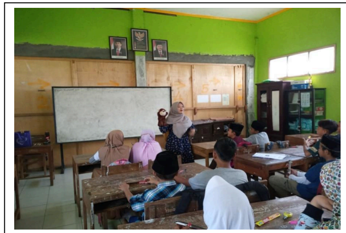
Figure 2. Puppet shows in teaching vocabulary

Students in both cycles were given puppet to use to teach vocabulary. During this cycle, pupils appeared to be eager to listen to the subject. Objects and obstacles they faced were replicated in the simulation. Children chose the space, as well as the components of disease management that were essential to them, and they felt more at peace (Suzan et al., 2020). Students are more responsive to learning when they are comfortable (Banfield, 2020; Puspitasari et al., 2019). Students are also exposed to authentic examples of the second language through puppet as presented in the following figure.