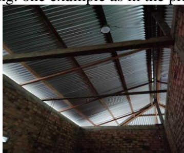
Figure 6. Pictures of ceilings that are not good

Based on the results obtained that the sky - lagit house there who berplafon da nada also not berplafon, as many as 32 respondents (57.1%) that the ceiling of the House does not meet the requirements have experienced Ari sufferers. Based on the results of the study researchers bepenangat that existing homes in the Working Area of the Health Center Simpang Pandan almost every house is not fitted with a ceiling. one example as in the picture below :