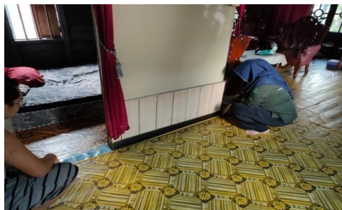
Figure 1. Occupancy Density Picture

The results of research in the Working Area of the Simpang Pandan Health Center were obtained from the calculation of 44 respondents (42.7%) are not eligible for it needs to be considered again when the room area is not eligible, and there is one family member who is sick ISPA better not combined his bed in one room to prevent disease transmission. Narrow room conditions and too many residents even 2-3 toddlers will accelerate the transmission of Ari. % , one example as shown below :