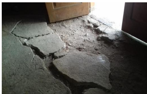
Figure 2, Bad floor picture

Based on the picture above floor conditions indicate the condition of the floor that does not meet the requirements of a good floor, such as floors made of soil, cement that has not been in kermaik, and dusty, supported by poor health behavior, such as not doing floor cleaning every morning and evening, rarely mopping the floor. Dirty floor conditions become a breeding ground for disease-causing bacteria send qualified as many as 43 respondents 41.7%. one example as in the picture below :