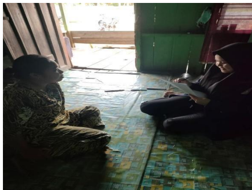
Figure 10. Knowledge Respondents

while the knowledge of mothers who are not as many as 9 respondents (34.6%). one example as in the picture below :