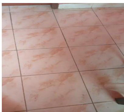
Figure 3 picture of a good floor

Based on the picture above floor conditions indicate the condition of the floor that does not meet the requirements of a good floor, such as floors made of soil, cement that has not been in kermaik, and dusty, supported by poor health behavior, such as not doing floor cleaning every morning and evening, rarely mopping the floor. Dirty floor conditions become a breeding ground for disease-causing bacteria send qualified as many as 43 respondents 41.7%. one example as in the picture below :