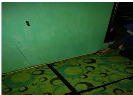
Figure 8. Bad lighting pictures

Based on the picture above lighting conditions indicate the existence of lighting conditions that do not meet the requirements of good lighting, most home lighting is not good, less than the intensity of 60 lux.