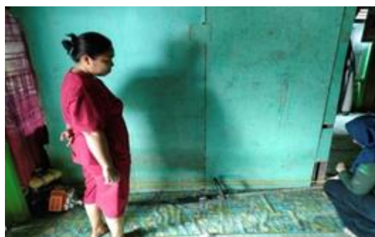
Figure 4. Bad Wall pictures

The results showed that there were 35 respondents (55.6%) whose walls did not meet the requirements had suffered from Ari. However, there are 12 respondents (30.0%) with the type of wall that meets the requirements but never suffered Ari because some of the respondents' houses that have been made of batubata but have not been plastered look dirty and dusty, so as to increase the seeds of disease multiply so as to cause the health of toddlers decreased. From the results of more research most types of walls do not meet the requirements, one an example as in the picture below :