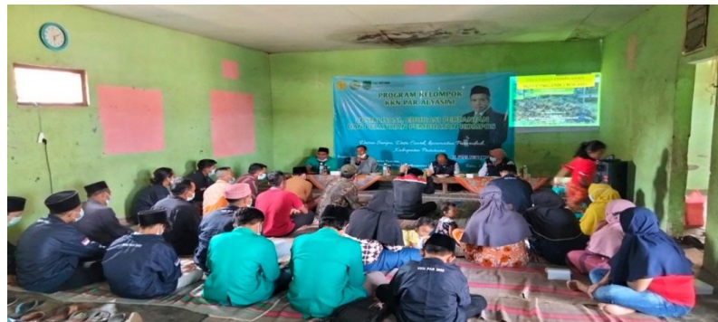
Fig.2. Socialization of organic fertilizer program