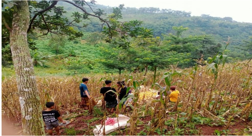
Figure 1. Rice fields planted with corn